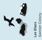
Les Etacs Gannet Colony